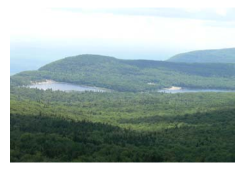
North/South Lake in Haines Falls

There have been suggestions that the MHCUG website could be improved. I am happy to consider proposed changes. One way to get ideas is to note any site that you visit that looks especially nice or is particularly easy to use. Please send the complete URL for such sites to me to give me ideas. Thanks, Hugh N. Ross, webmaster.